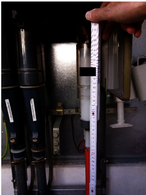
FIG. 3 Critical height of a switching station

A distinction is made between direct and indirect failure. The repair work for indirect failures is easier because the object itself has not been flooded. Switching stations or substations that fail directly therefore get a poorer label.