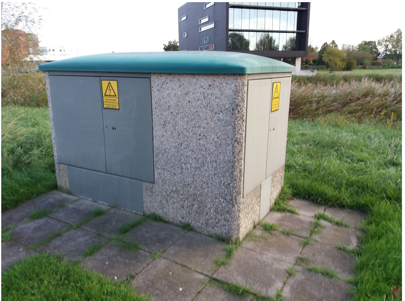
FIG. 1 Substation

In the first instance, risk labels have been determined for about 3,800 substations and switching stations on the electricity grid. The risk label indicates how 'vulnerable' the station is. The measures that could be taken to strengthen it were then examined. These could for instance involve smarter choices of the locations for crucial switching stations or substations, extra protection, configuring systems inside switching stations or substations so that they are physically raised, as well as diversions in the grid routing or additional connections.